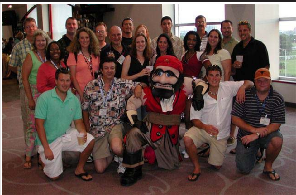
FLORIDA TECH AERO ALUMNI AT THE 2005 FLORIDA AIRPORTS COUNCIL ANNUAL MEETING